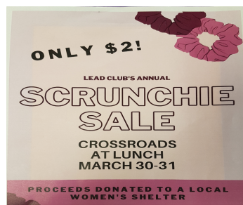
LEAD's Scrunchie Sale Proceeds & Student Council's Bake Sale Proceeds Donated to a Local Women's Shelter